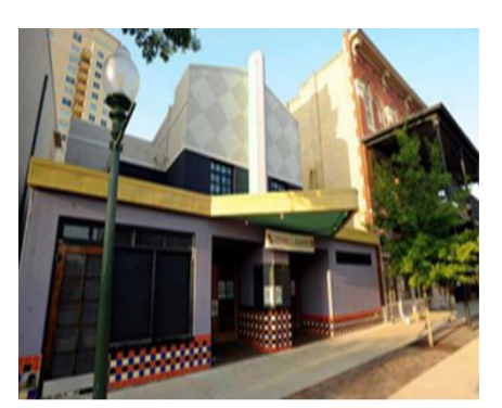
Cameo Theatre 2015<sup>14</sup>

The Cameo Theatre was originally built in 1940. It had a house seating of around 574 seats. <sup>15</sup> Built in a largely African American neighborhood, the Cameo Theatre was specifically built for blacks. It was a place for them to be accepted. A writer from the San Antonio Observer writes: