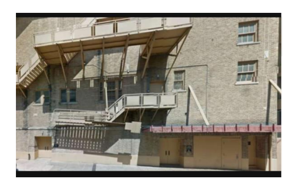
My San Antonio.com<sup>6</sup>

Having a separate entrance for any establishment was not uncommon. It is strange though that they would not get to see the beautiful lobby entrance and receive the full experience that only whites got to experience. For the world of theatre today, being inclusive and not judging anyone by anything much less skin color is a huge standpoint they try to make. Of course, it has nearly been 85 years since any segregation in a theatre has been in place, but for a place that stands for family sure shows how separated one can be.