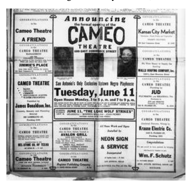
San Antonio Register Friday June 7th, 1940<sup>17</sup>

The Cameo Theatre compared to other theaters in San Antonio such as The Rex and The Majestic is in its own category. The Cameo Theatre gave experiences and opportunities that was just for minorities. They did not have to accommodate their leisure time for anyone else. They got to experience a night of enjoyment without worrying if they could or could not sit as a family.